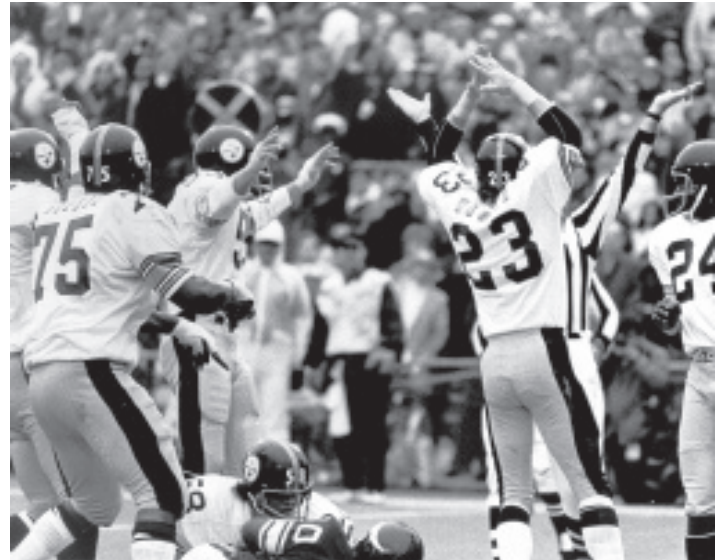
The Steelers celebrate their safety against Vikings' quarterback Fran Tarkenton in Super Bowl IX.

Soon after the ensuing kickoff, Pittsburgh's Mike Wagner intercepted a Tarkenton pass, and the Steelers held possession until the game was nearly over.