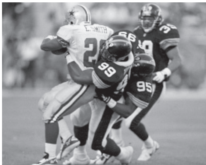
Pittsburgh's defense limited Dallas to just 56 rushing yards in their Super Bowl XXX matchup.

The statistical irony of the day was that O'Donnell entered the game as the NFL's career leader in fewest interceptions per pass attempt. On the game's final play, he was intercepted for the third time.