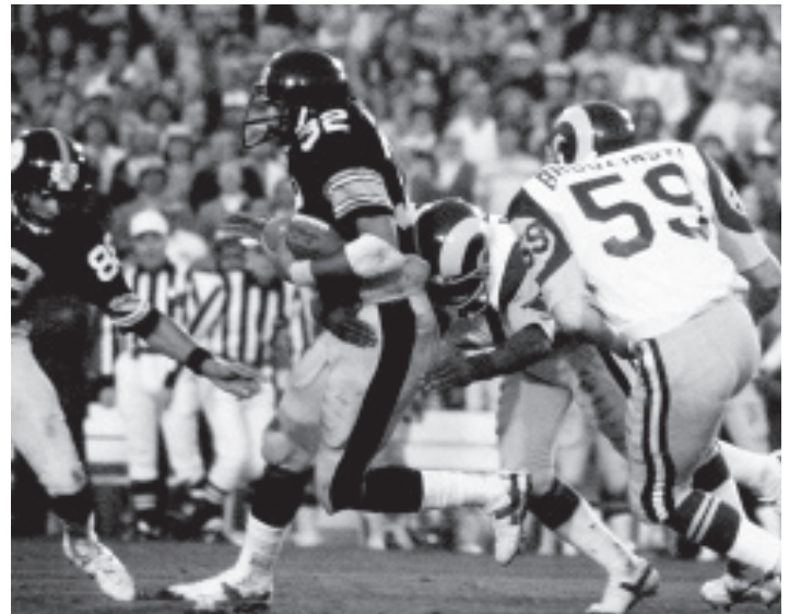
Steelers’ running back Franco Harris ran for two touchdowns, including the game’s final score, as Pittsburgh recorded a 31-19 win over the Los Angeles Rams in Super Bowl XIV.

For the second year in a row, Bradshaw was named the game’s most valuable player after passing for 309 yards and 2 touchdowns.