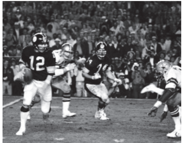
Steelers' quarterback Terry Bradshaw threw for 318 yards and four touchdowns in the 35-31 victory over Dallas in Super Bowl XIII.

With the victory, the Steelers became the first team to win three Super Bowls. The two teams set a Super Bowl record for points scored.