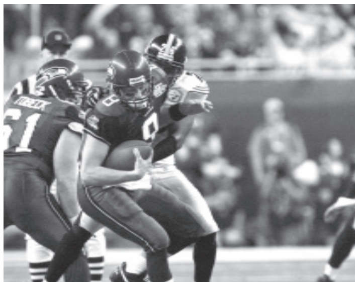
Pittsburgh's Deshea Townsend had one of three sacks in the Steelers' 21-10 victory over the Seattle Seahawks in Super Bowl XL.

Pittsburgh's defense racked up three sacks, including one each from CB Deshea Townsend, LB Clark Haggans and NT Casey Hampton.