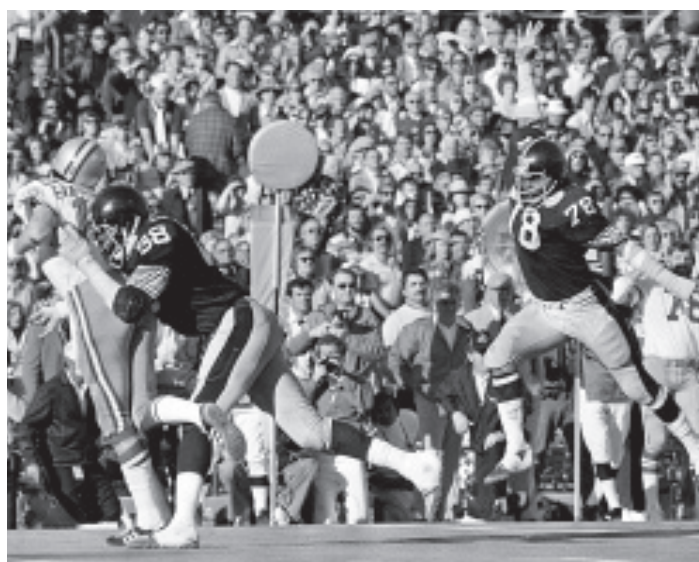
Pittsburgh’s “Steel Curtain” defense forced Cowboys’ quarterback Roger Staubach into throwing three interceptions in the Steelers’ Super Bowl X victory.

Trailing only 21-17, Staubach had the ball back with more time than he usually needed to negotiate 61 yards. The Cowboys reached Pittsburgh’s 38. With five seconds left, Staubach launched his final pass into the end zone. Steelers Mike Wagner batted the ball, which was caught by the Steelers, Glen Edwards and the Steelers had their second consecutive Super Bowl victory.