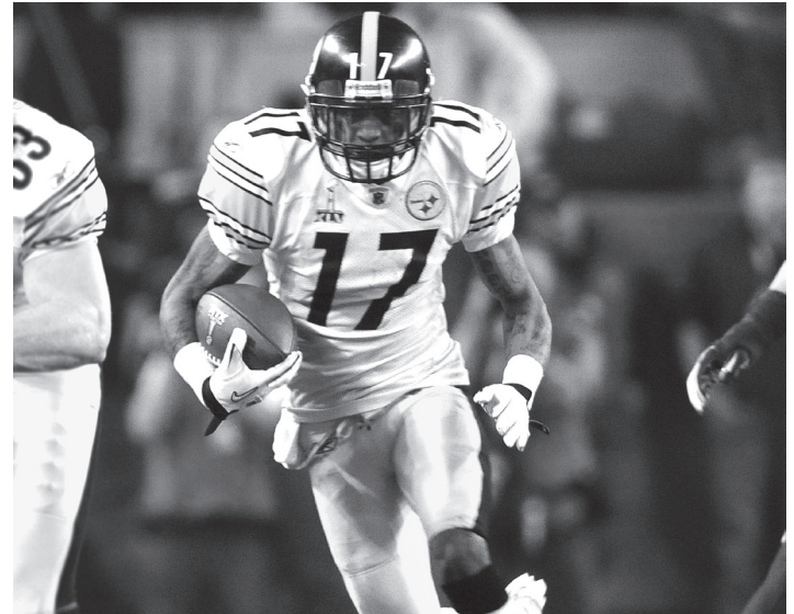
WR Mike Wallace finished with nine catches for 89 yards and a touchdown in Super Bowl XLV.

On the Packers' next drive, K Mason Crosby connected from 23 yards out to give Green Bay a six-point lead. The Steelers still had time, taking over with two minutes left in the game, but they failed to convert a fourth-and-five from their own 33-yard line.